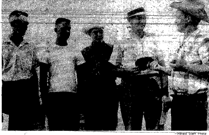
CARROLL'S BLUE RIBBON WINNERS, 4-H club took top honors in the judging contest held in conjunction with Hervale Farms field day.